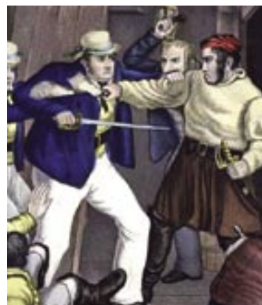
Smugglers Fighting (Anon)

Pirate ships would approach and board merchant vessels, often beating or killing the crew. Cargoes would be seized and sometimes the ship would be taken.