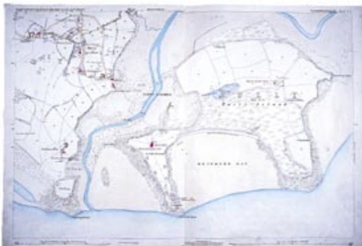
Historical OS Map of Barry 1875