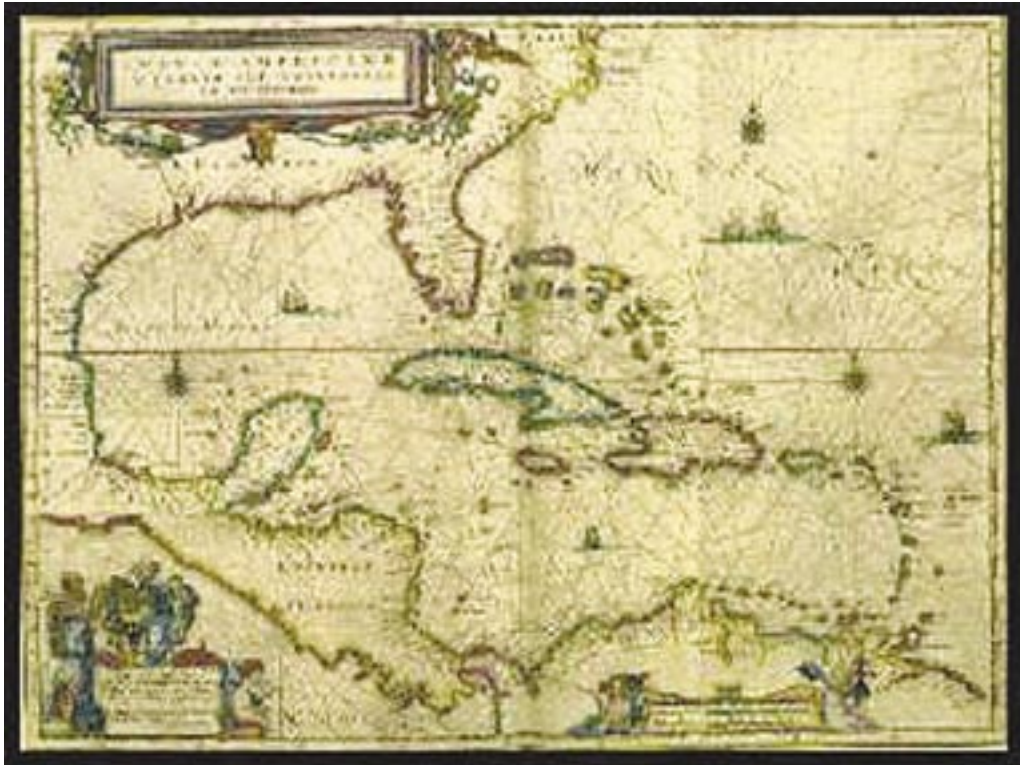
The New World

Punishments included walking the plank, being marooned on an island, having a limb cut off or being shot.