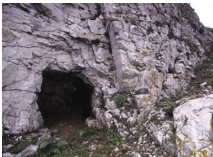
Smuggling Caves at Sully

The Severn Estuary was notorious for smugglers and pirates. The shape of the channel made it easy for smugglers to avoid customs officers. When the King's men were collecting payments at Bristol, ships' masters would often escape to the unmanned ports of Barry or Cardiff and when officers were at Barry, they could escape to Bristol.